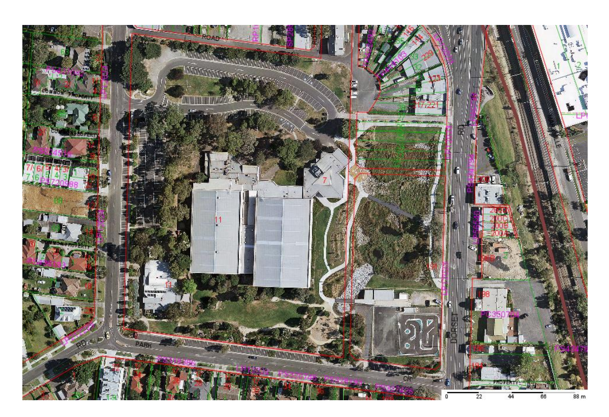
Plate One - Boronia Park

To reach the desired capacity, the retarding basin needs to be increased by approximately 50% in order to offer greater flood protection to Pine Crescent and the adjacent buildings during a 100-year storm event. Any increase in the size and capacity of the retarding basin is limited by the physical location of the stadium and the library. Refer Plate One.