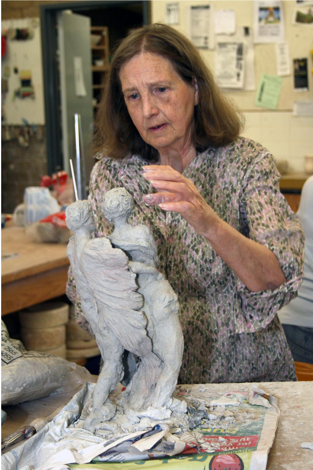
Pottery classes, Ferntree Gully Community Arts Centre.