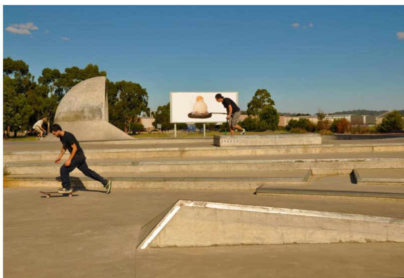
Billboard at Knox Regional Skate and BMX park.

The plan also supports Council's Community Health and Wellbeing Strategy and the commitment to improved partnering and advocacy within the community. The plan will actively contribute to the Strategy's outcomes, supporting healthy living, lifelong learning and safer communities. Key areas of contribution include; improving Citizen Participation through the growth and support of volunteerism, community participation and engagement on key issues, and in the area of Leisure and Culture with improved cultural infrastructure and access to local arts and cultural activity, and continuing to secure good attendance levels at festivals, events and arts programs.