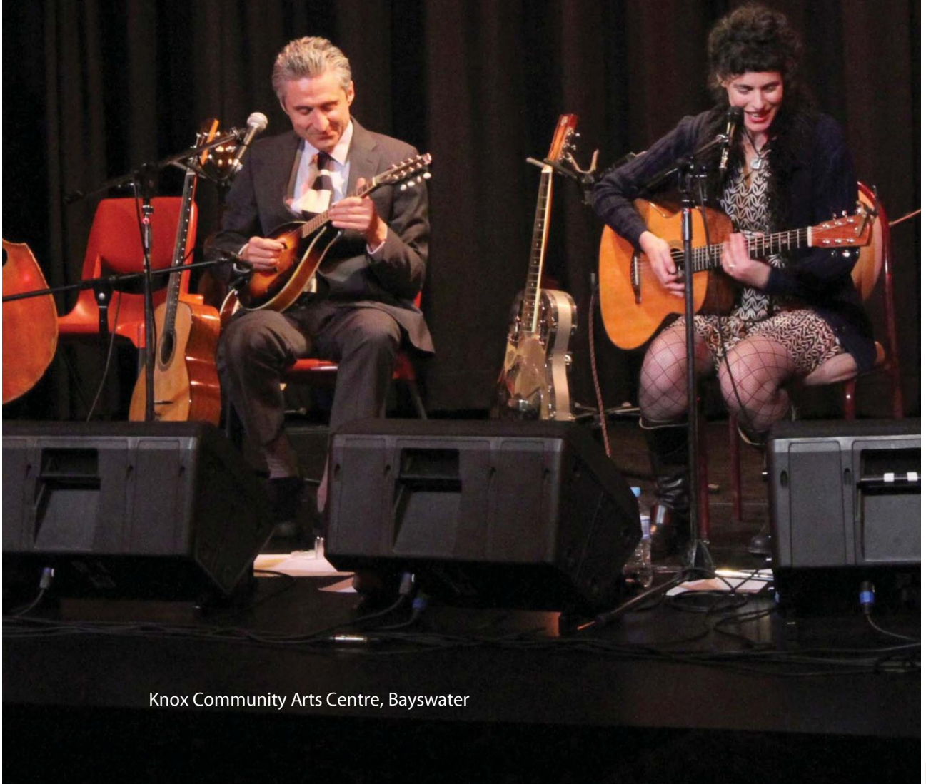
Knox Community Arts Centre, Bayswater