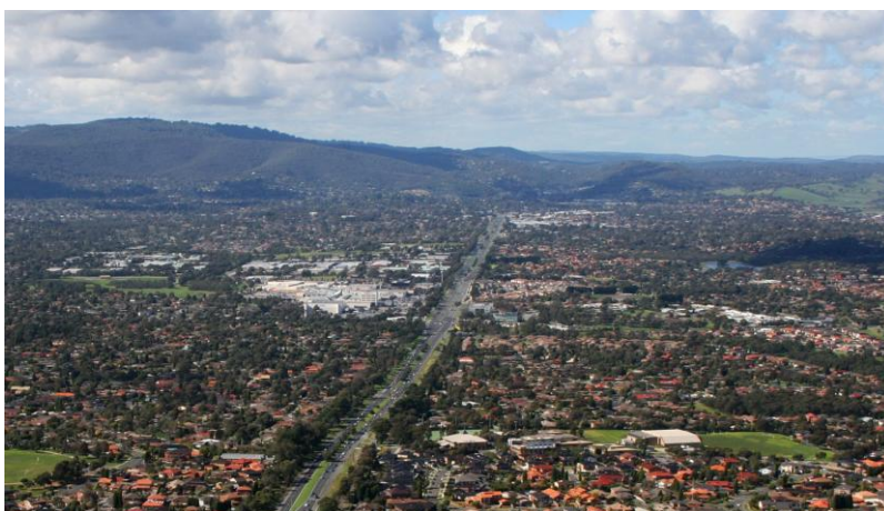
Aerial view of Knox

The growth in internet connectivity is also a key driver for the city, with recent statistics indicating a growing number of Knox households with internet connection. Reliable and accessible information remains a valuable tool the community at large and the arts community specifically. Creative small businesses benefit greatly from the creation of a highly visible shared virtual environment. Recognising and responding to the community's growing commitment to a high level technological literacy will be a reflection of the City's changing lifestyles.