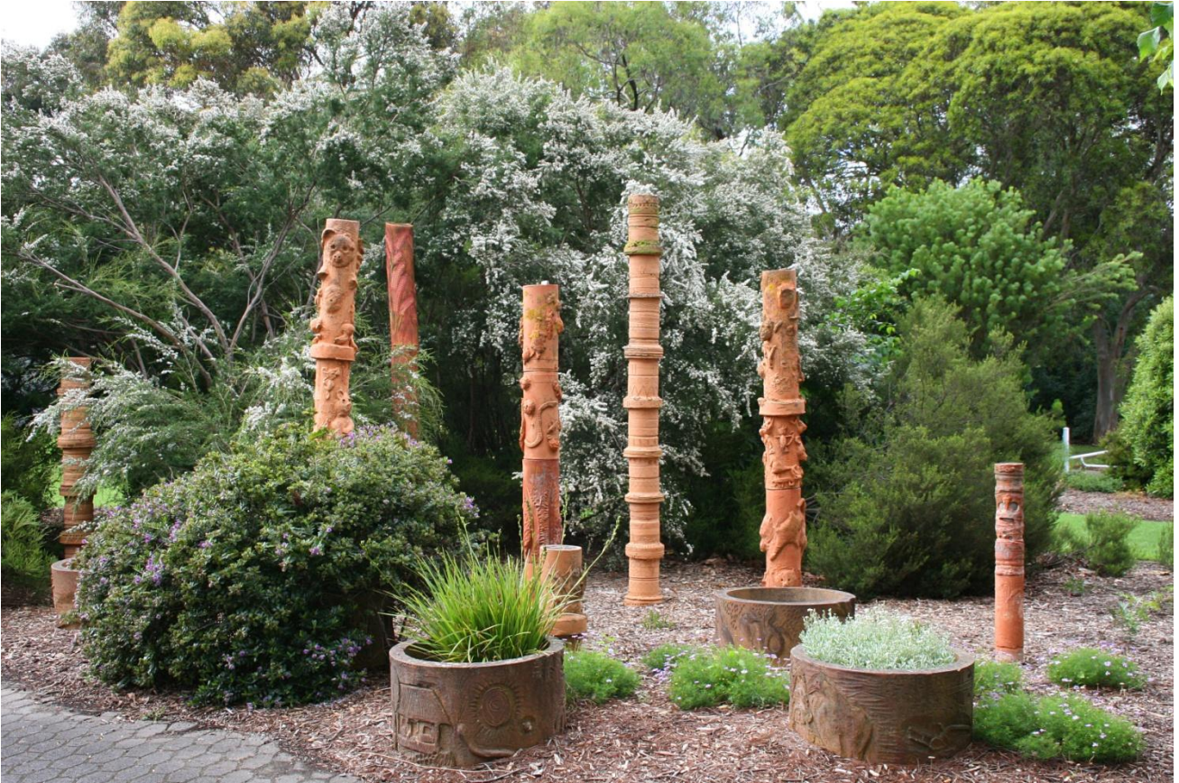
Pottery totem poles, Ferntree Gully Library.

It is anticipated that by providing a clear and supported program of development for the city's cultural wellbeing, that these opportunities can be accessed with increasing effectiveness.