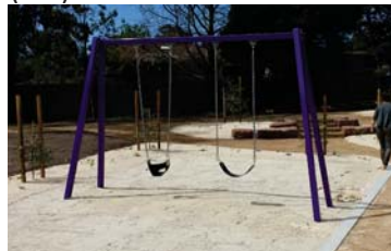
2b. Double swing with junior seat