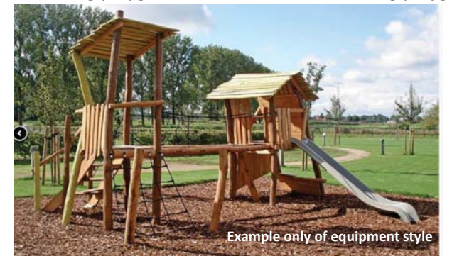
Example only of equipment style

Let us know what you think by contacting us: