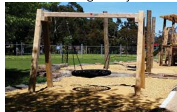
2a. Basket swing

We would like to know would you prefer a basket swing (2a.) or a double swing with junior seat (2b.)?