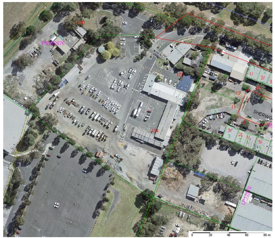
Figure One - The existing Knox Operations Centre site