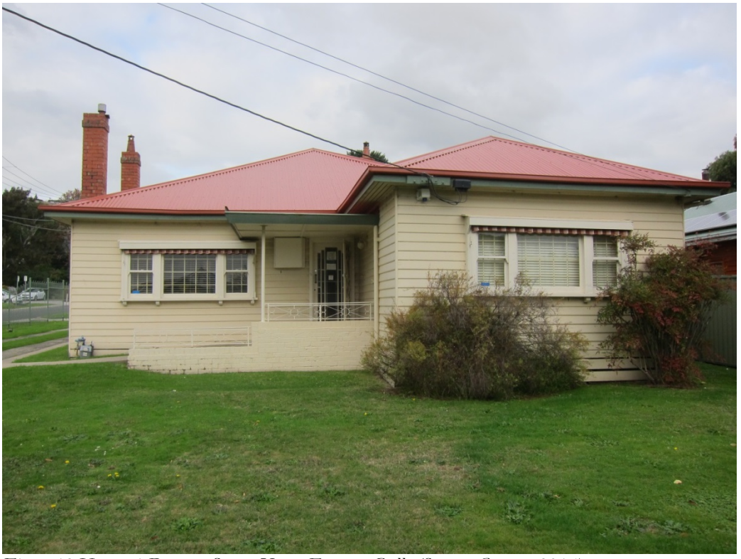
Figure 12 House, 1 Dawson Street, Upper Ferntree Gully (Source: Context 2015).