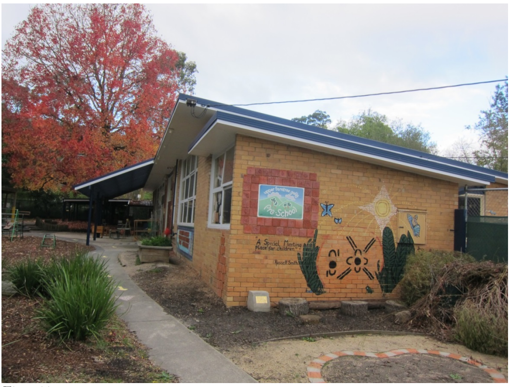
Figure 11 Pre School and Children and Family Centre, 1 Rollings Road, Upper Ferntree Gully (Source: Context 2015).