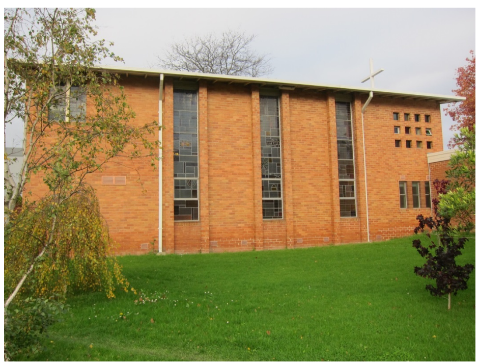
Figure 10 St Thomas Anglican Church, 12 Mount View Road, Upper Ferntree Gully (Source: Context 2015).