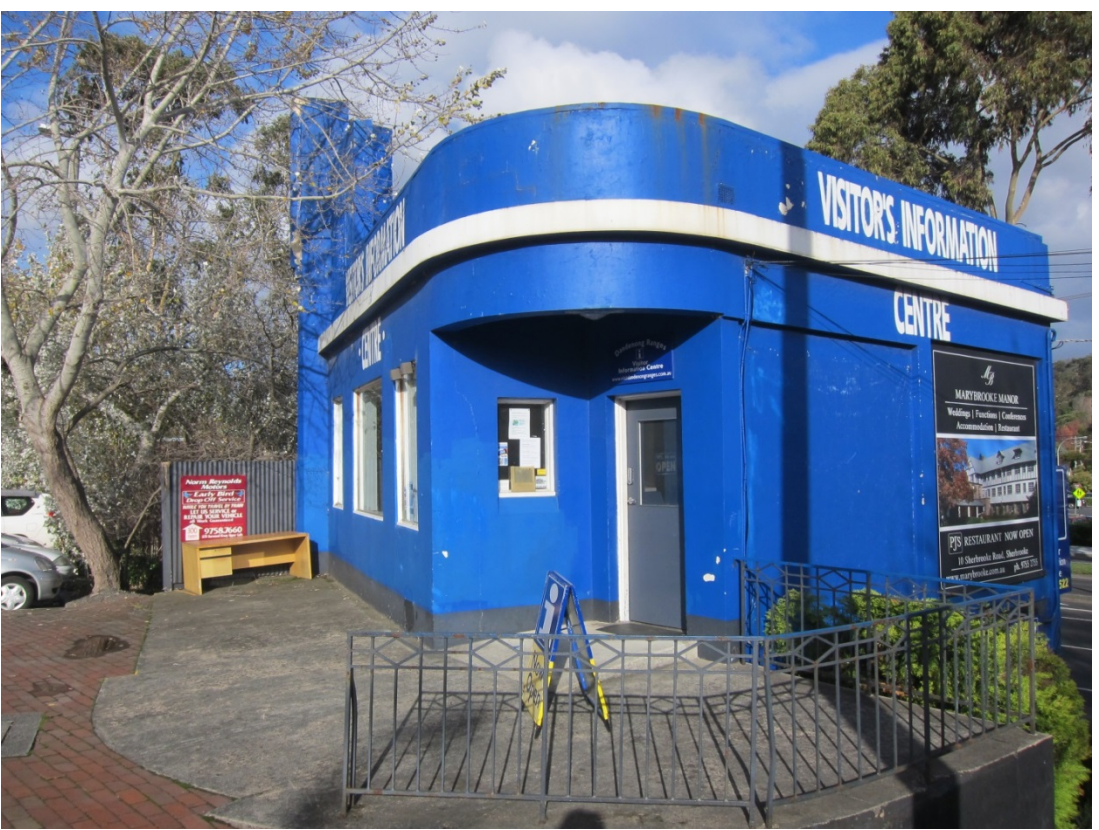
Figure 5 Visitors Information Centre, 1211 Burwood Highway, Upper Ferntree Gully.

Place Type Commercial Citation Date 19.6.2015