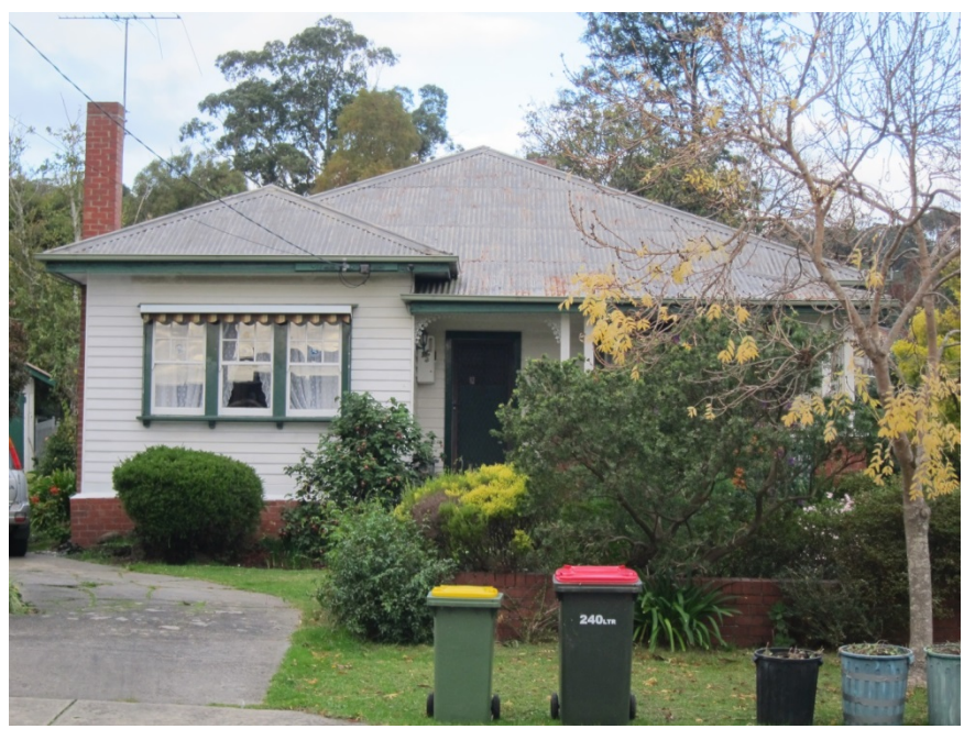
Figure 13 House, 3 Rollings Road, Upper Ferntree Gully