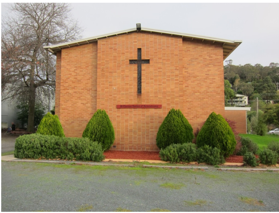
Figure 9 St Thomas Anglican Church, 12 Mount View Road, Upper Ferntree Gully.