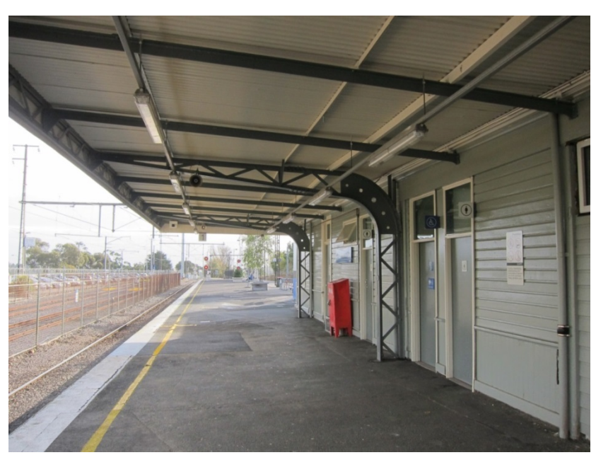
Figure 8 Upper Ferntree Gully Railway Station, Upper Ferntree Gully (Source: Context 2015).