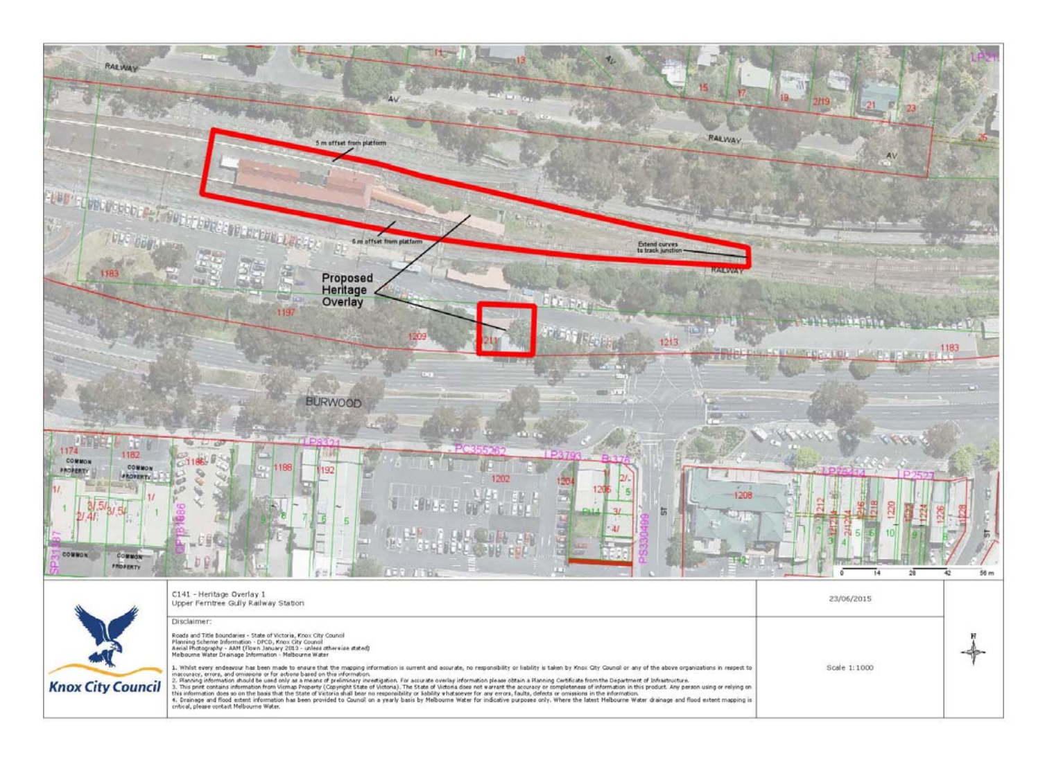
Figure 4 Railway Station and Visitor Information Centre proposed Heritage Overlay.