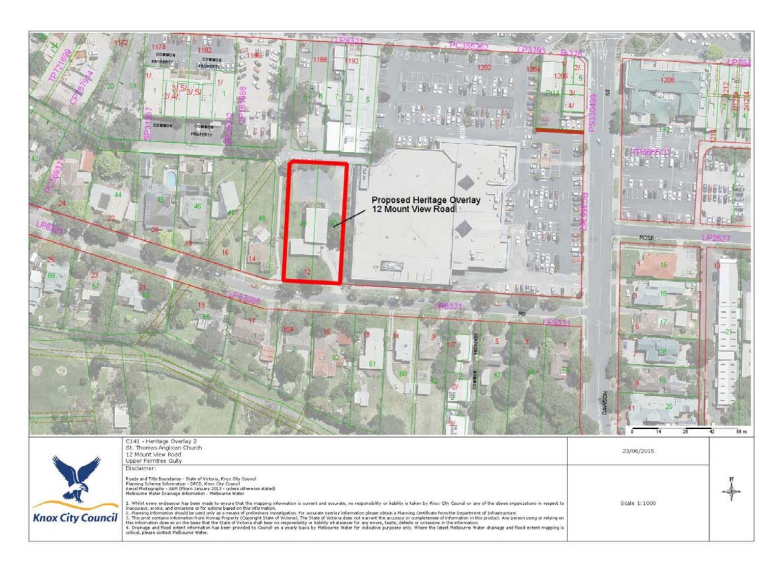
Figure 3 St Thomas' Anglican Church proposed Heritage Overlay