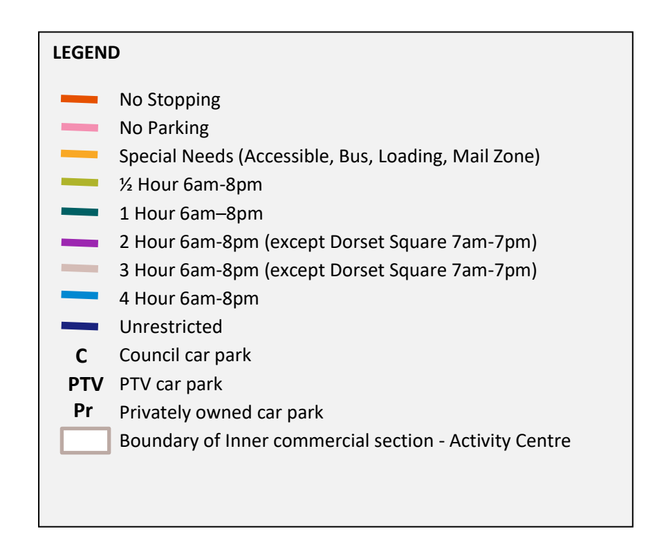
Plan endorsed • Council to endorse Parking Management Plan • Businesses and residents in Stage 1 - Commercial area • Install/update restrictions for Stage 1 as shown on the plan