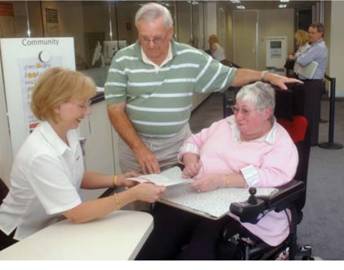
"I go to businesses that are easily accessible both at the entrance and within the store. These are places I go back to and recommend to friends". KNOX RESIDENT